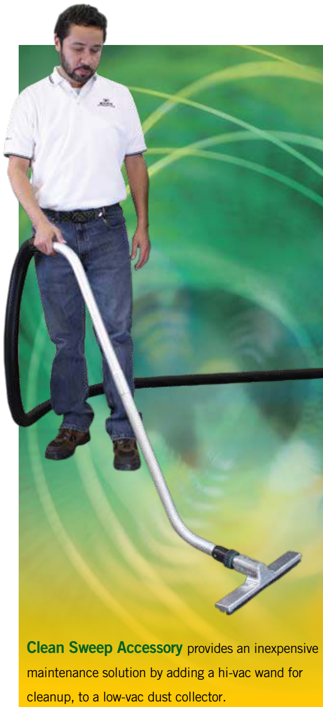
Clean Sweep Accessory provides an inexpensive maintenance solution by adding a hi-vac wand for cleanup, to a low-vac dust collector.