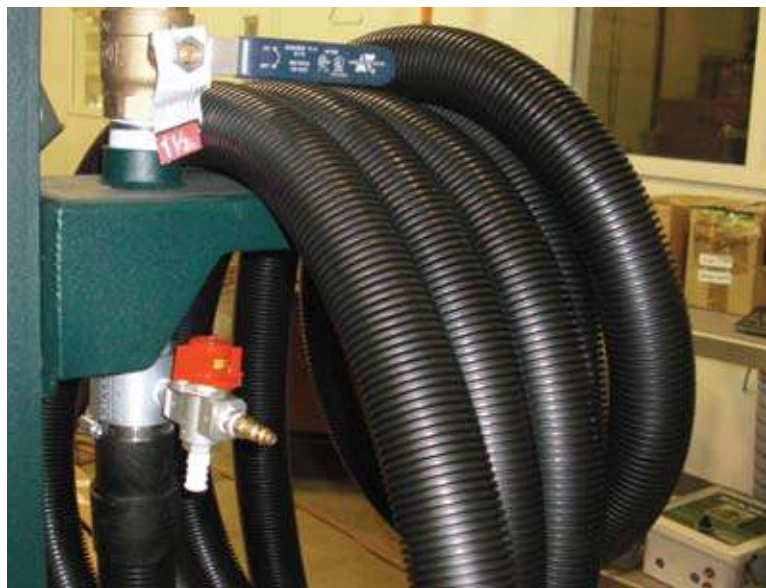
Venturi Vacuum Pump shut off valve and hose, make up the Clean Sweep System.

Description: A vacuum hose system which uses a pneumatic vacuum pump to draw the dust into the dust collector. The pump is powered by the same compressed air line which cleans the dust collector filters. The vacuum pump has venturi nozzles, which creates a vacuum of up to 40" w.g. when the compressed air is applied. The dust is drawn into the inlet of the dust collector before the channel baffles so that large objects will not contact the filter media. A shut-off valve is mounted in the hose so that the Clean Sweep system is isolated from the dust collector when not in operation. A shut-off valve is also mounted to the vacuum pump so that the compressed air is only used when the system is in operation. The system includes a floor sweep and crevice nozzle.